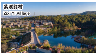
紫溪彝村 Zixi Yi Village