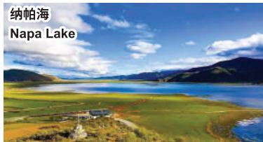
纳帕海 Napa Lake