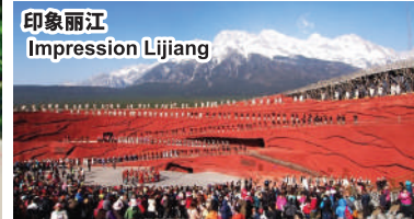
印象丽江 Impression Lijiang