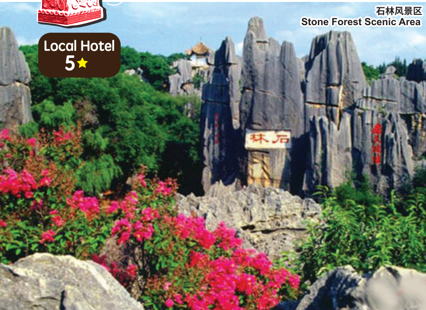
石林风景区 Stone Forest Scenic Area