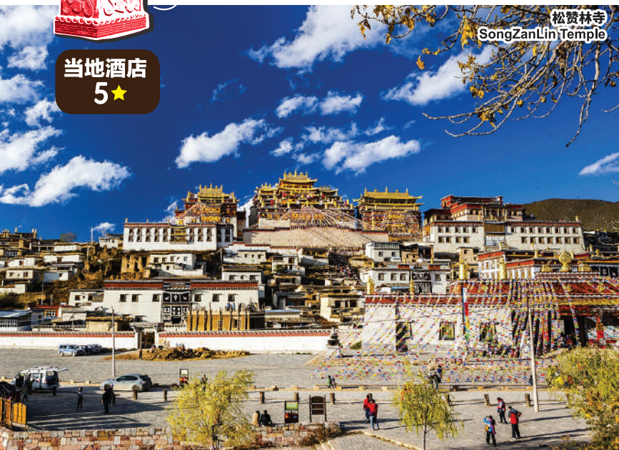
松赞林寺 Song Zan Lin Temple