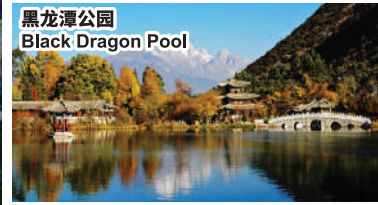
黑龙潭公园 Black Dragon Pool